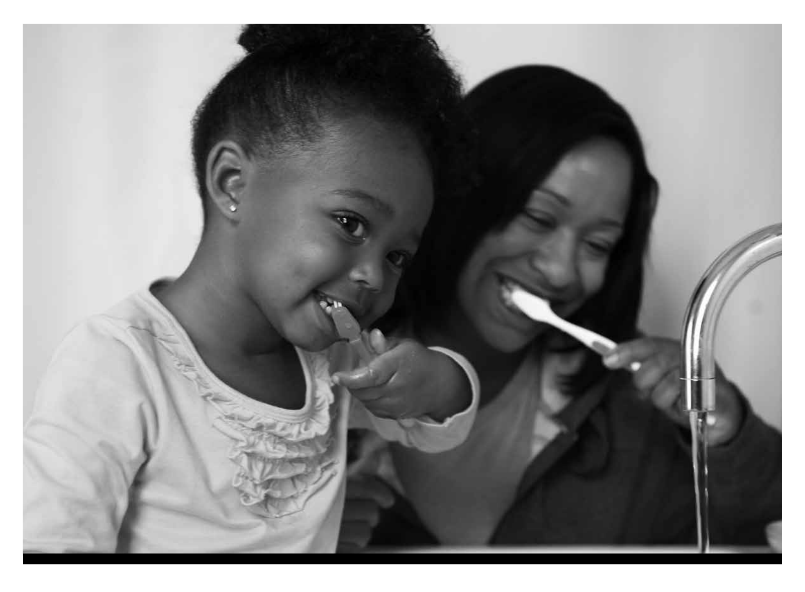
Missouri Medicare Dental Provider Manual for UnitedHealthcare Dual Complete